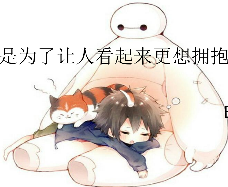
Big Hero 6